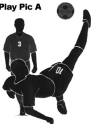
Play Pic A

Advice to referees: Rule 12.13 lists three important criteria to help you determine if dangerous play should be whistled: The action must be dangerous to someone, it was committed with an opponent close by and