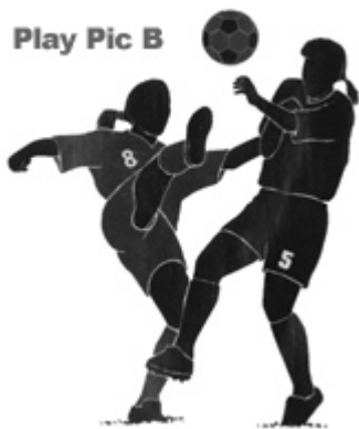
Play Pic B

In Play Pic B, as player 5 realizes player 8's leg is coming up, she reacts by drawing her arm in to protect her body and retracts her head and neck to avoid injury. Had 8 not lifted her foot so high, 5 would have headed the ball toward the goal or a teammate.