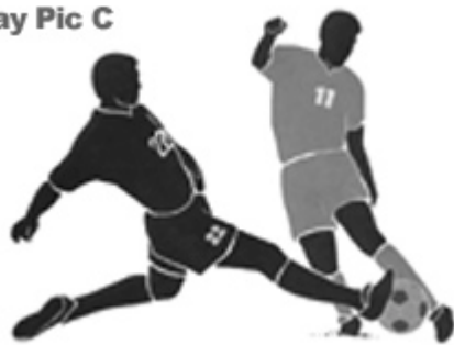
Play Pic C